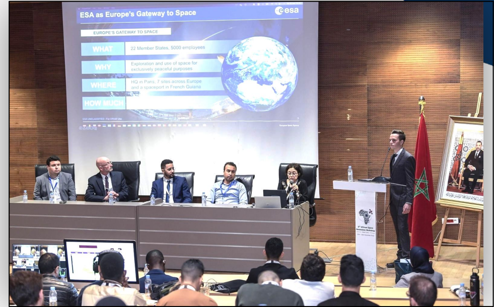
Image2: Panel discussion