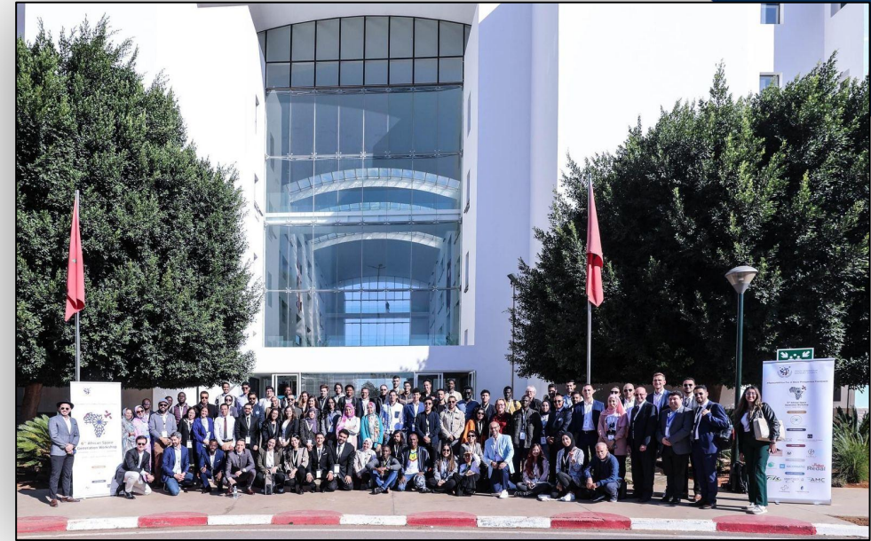
Image4: Picture of the participants in the AF-SGW including the delegates the partners and the professionals